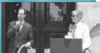
Assemblyman Levine and Senator Torlakson at Faire.