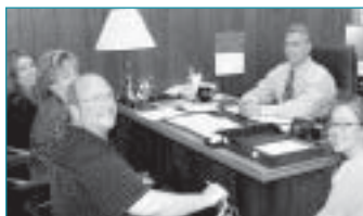
Delivering the message

Prohibits the manufacture, sale, or distribution in commerce of certain toys and child care articles if those products contain types of phthalates in concentrations exceeding a specified percentage. Requires manufacturers to use the least toxic alternative when replacing phthalates. Prohibits manufacturers from replacing