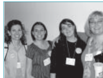
Sacramento's Home Team