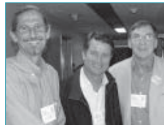
Threshold's Three Musketeers