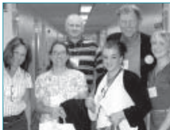
Pausing between appointments