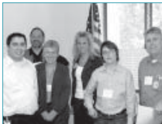
Message well received