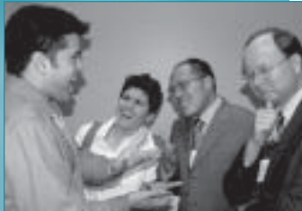
"Hey, advocacy is fun!" 5th Annual 'Health Matters!' Advocacy Day