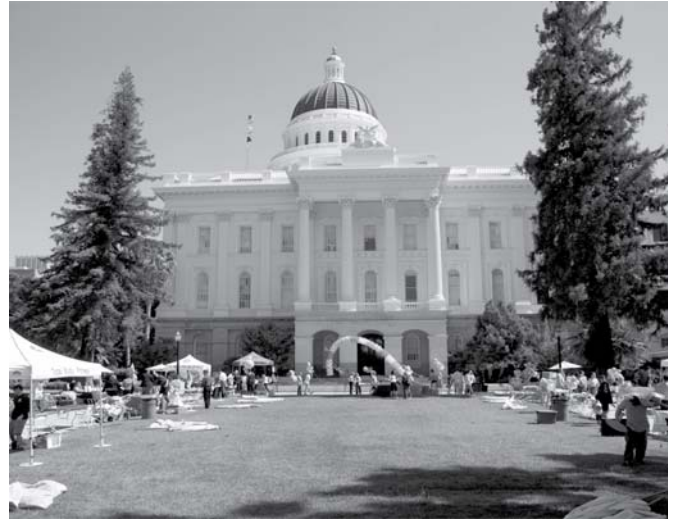
May 21, 2008 Capitol Park, Sacramento, CA